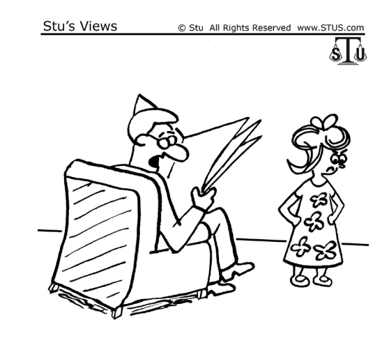
No, you can't get a $5 "advance on your inheritance".

Your loved ones need prudence, but they also need loving care. That is where the personal touch of a close family member or trusted advisor can make all the difference. Such persons can offer understanding when dealing with complex family relationships and unique personalities. Adding them to your trustee team is a real planning plus. Your estate planning attorney can assist you in selecting the proper combination of caring and competent trustees to ensure your own well-being and that of your loved ones.