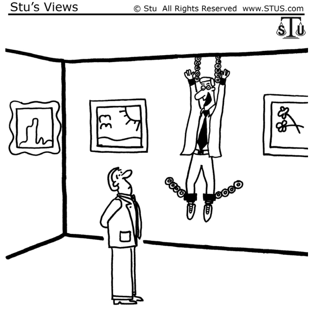
I'm a performance piece entitled, "The Probate Experience".

A living trust avoids probate when title to your various assets is transferred to the name of your trust while you are alive. On your death your living trust remains alive - your property and the instructions that accompany it are immediately available for the benefit of your loved ones - without the intervention of the probate process. Although a trust administration is often necessary, if the trust is fully funded (which means your trust owns your assets – but you control the trust!) all of the deceased's property and the trust provisions remain private.